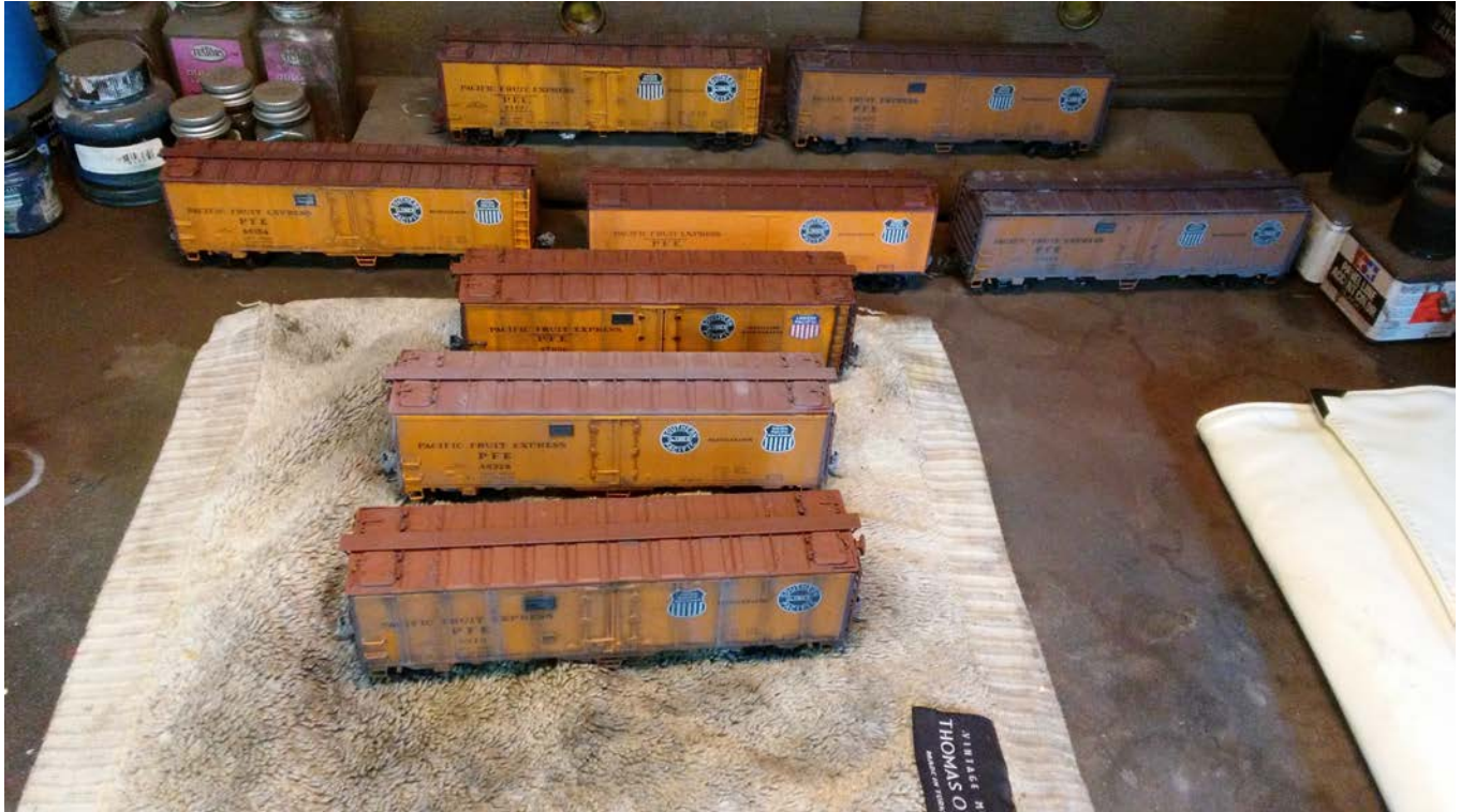
Reefers weathered with a friend

As we approach the one-year anniversary of the COVID-19 pandemic we all know that the world has changed forever. Shutdowns and quarantines have become a part of our daily conversations and there is no way to avoid the daily news reports on this subject. With luck, 2021 will bring back at least some of the things we have come to enjoy, Conventions, SpringRail, etc. I was counting on the Hobo Auction at SpringRail to boost my locomotive fleet, alas I will have to wait another year.